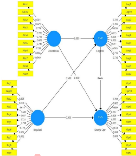
Fig. 2. Full Results of Research Model (Outer Model)

To ensure the relations among the construct, significant value, R-square (R2), relevance of Q-square (Q2) prediction, and the effective measurement of f-square (f2) of the research model, the structural model or inner model is tested. R-square for the dependent variable and the value of the path coefficient for the independent variable is used to assess the structural model. With a significance threshold of 0.05, the bootstrap technique is used in the structural model analysis of this research in SmartPLS. The structural model represents the relations among latent variables used in the research. The structural model in this research involves three exogenous latent variables, namely accessibility, logistics effectiveness, and cargo transport regulations, and one endogenous latent variable, namely operational performance. The following are the results of algorithmic calculation and bootstrapping for each variable in the structural model (Fig. 2 and Fig. 3).